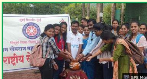
MERI MITTI MERA DESH