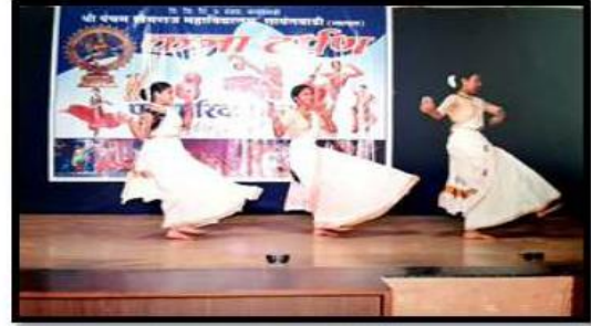
पारंपारीक दिनाच्या निमित्ताने आपला कलाविष्कार सादर करताना विद्यार्थी