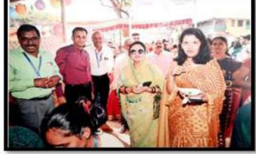
खाद्यमहोत्सवातील विविध स्टॉलला भेट देताना मान्यवर