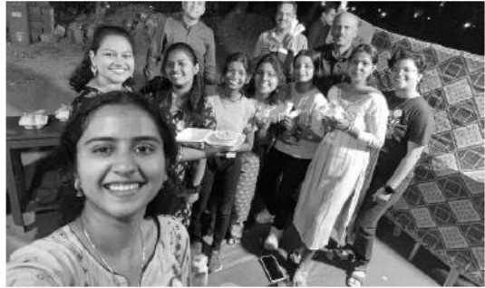
राजवाडा सावंतवाडी येथे आयोजित लोककला महोत्सव २०२४ (दशावतार) येथील फुड स्टॉलमधील डि.एल.एल.ई. चे सहभागी विद्यार्थी