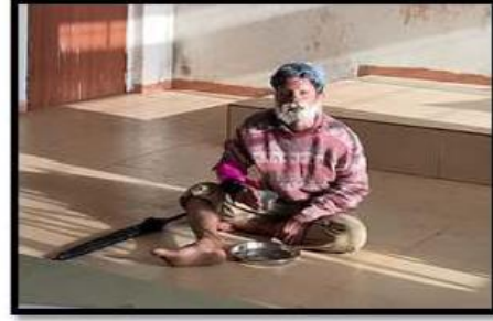
MONO ACTING (MARATHI)