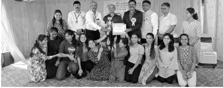
आजीवन अध्ययन व विस्तार विभाग (मुंबई विद्यापीठ) आयोजित वार्षिक महोत्सव "उडान २०२४" मध्ये आपल्या महाविद्यालयाने पथनाट्य या स्पर्धा प्रकारात प्रथम क्रमांक प्राप्त विद्यार्थी चषक स्वीकारताना.