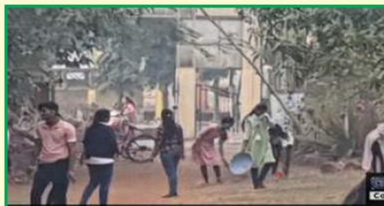
COLLEGE CAMPUS CLEANING: