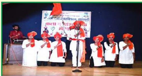
AZADI KA AMRUT MAHOTSAV