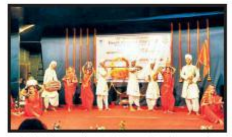
मुंबई विद्यापीठ युवा महोत्सवांतर्गत जिल्हास्तरीय 'लोकनृत्य' स्पर्धेत सहभागी महाविद्यालयाचा संघ