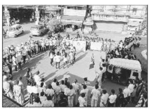
एडस् जनजागृती रॅली मध्ये पथनाट्य सादर करताना