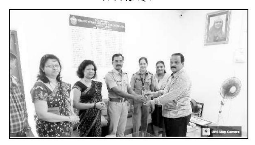
हेअर स्टाईल स्पर्धा