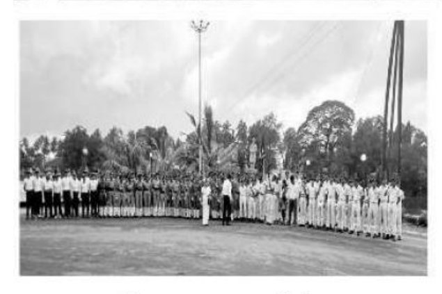
१५ ऑगस्ट २०२२ प्रभातफेरी