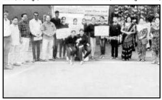
सावंतवाडी नगरपरिषदेतर्फे 'स्वच्छ रॅंकींग स्पर्धा' अंतर्गत पथनाट्य स्पर्धेत प्रथम पारितोषिक विजेता संघ