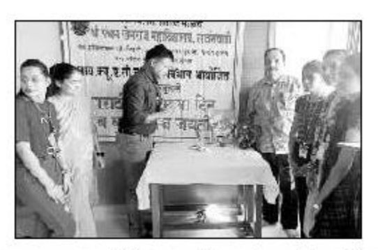
कुसुमाग्रज जयंती व मराठी राजभाषा गौरव दिन