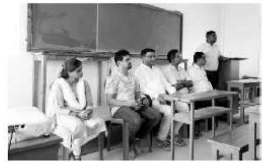
IPR Awareness Program in collaboration with Delhi Patent Office